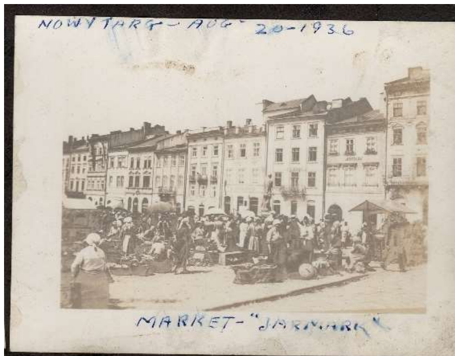
Nowy Targ Aug 20 1936 – Market ‘ Jarmark’ To learn more, see page 8