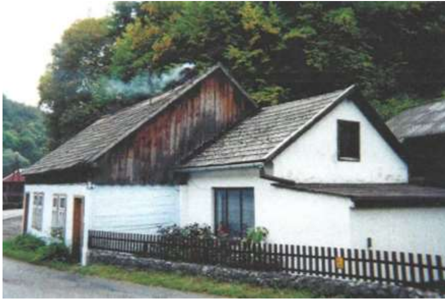
Fig. 2 A rustic country home in southern Poland - hewn logs with masonry addition.