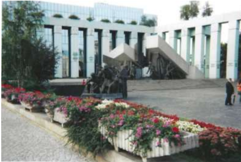
Fig. 8 The images of the statues of the Polish freedom fighters of 1944 still appear in the author's dreams.

Semko and I then ventured to the Old Town Market Place where we visited various shops and galleries catering to the tourist trade. Many of the items were inexpensive. However, it was fun to see the generally good craftsmanship and bright and optimistic colors decorating the inventory. Also, I never saw so much amber jewelry! We then ate dinner at an outdoor café and talked about Poland and its prospects well into the evening. We both agreed that any nation that had always exhibited such courage, no matter what the odds, could never be permanently defeated! And now the future seemed bright!