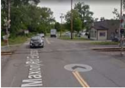
Fig. 3 is perhaps one of the last, if not the last (once the D&H) railroad crossing at grade in the City of Schenectady, looking east along the Maxon Road Extension. Katie would cross two (a second today is a bike trail) and walk east to her sister's home to the right on Alexander Street. The bike trail when completed will pass, nearly door to door, what were once the homes of Katie and Maryanna.