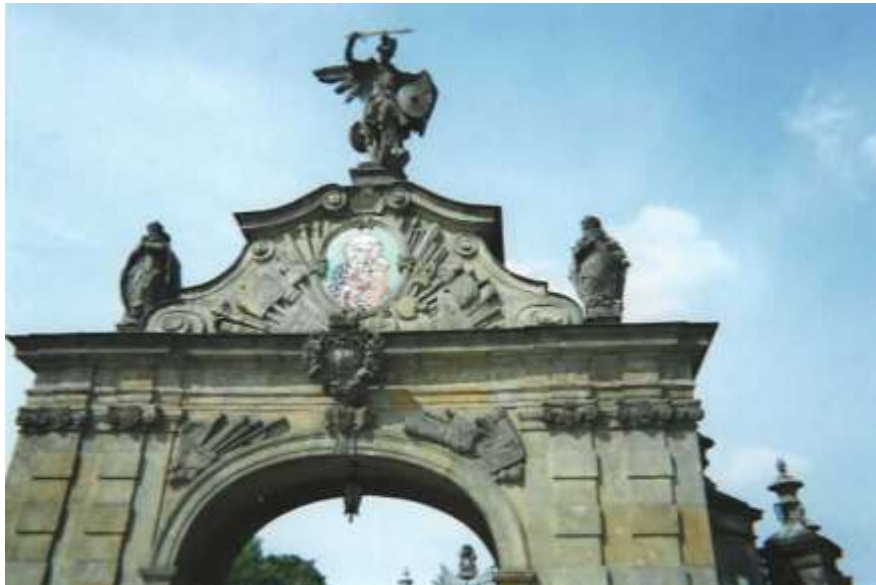
Fig. 1 Jeff took this photo while entering the gate to the Czestochowa compound.

As the countryside became more rural, I saw women and children picking mushrooms in the thick, dark forests and selling them in large wooden boxes along the roadside. In more open areas, cows were tethered to stakes so they could graze. The small country houses would have piles of extra concrete blocks stacked up in the yard, ready for resale or a small job. It was common to see small to mid-sized gardens being tended. Everywhere, one could see the entrepreneurial spirit of the people at work.