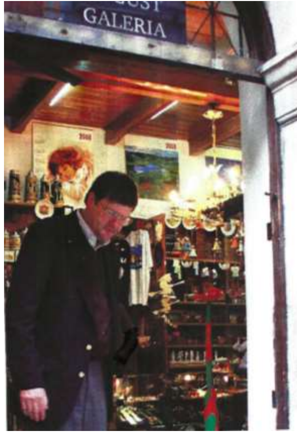
Fig. 7 Author shopping in Warsaw.

Later in the day I was joined by my friend, Semko, who had come in by train to join me. We walked to the Old Town to see the sights within its walls. Sigismundus' Column, a monument to a Polish King from the early 1600s, dominates the Castle Square in front of the building formerly known as the Royal Castle. It is the oldest monument in Poland and a great symbol of Warsaw. Close by is the statue of Jan Kilinski, a famous patriot from the days of Kosciuszko's Rebellion against the Russians in the 1790s. The statue became a symbol of Polish resistance to Nazi occupation during WWII. The emotional power of the monuments to the 1943 Jewish Uprising on Zamenhofa Street and the 1944 Warsaw Uprising in Krasinscy Square made lasting impressions on me. In particular, the image of the freedom fighters emerging from the sewers to man the barricades has never left my mind (Fig. 8). After crushing these attempts to resist tyranny, the Nazis punished the Polish people by destroying Warsaw and razing it to the ground. The Old Town we see today has been rebuilt to its former appearance using old plans, drawings, paintings, photographs and maps.