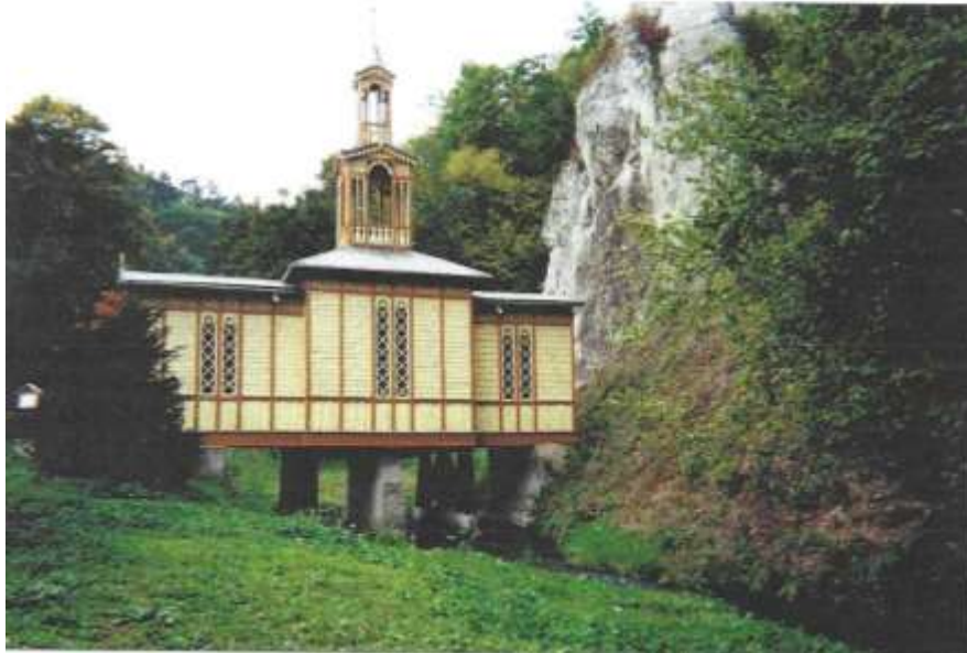
Fig. 3 Wooden church nestled against limestone outcrop.