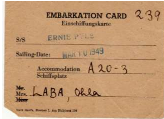
Fig. 3b Ohla Laba's Embarkation Card