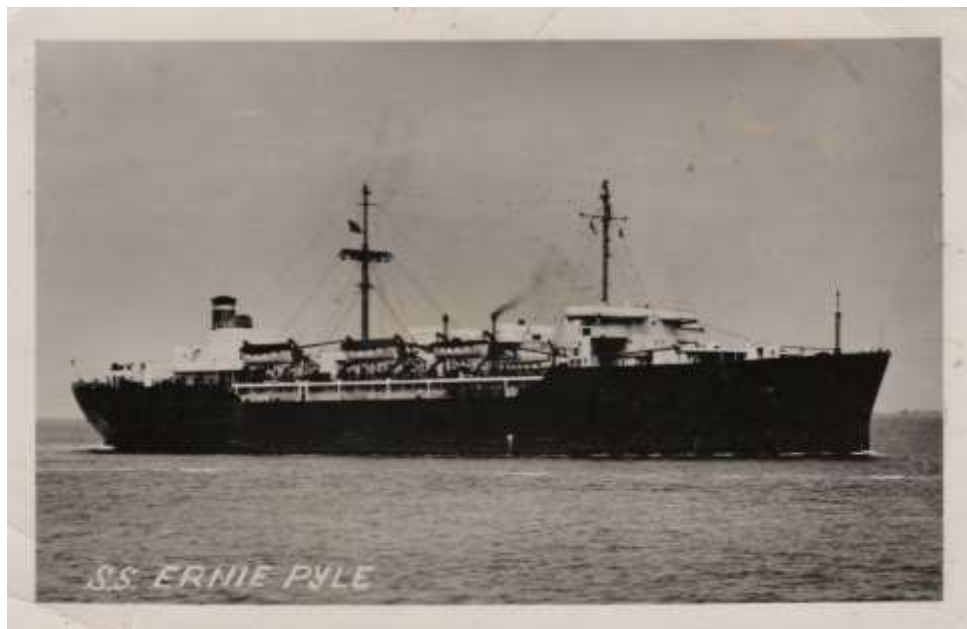
Fig. 3a USS Ernie Pyle – a former troop ship – transportation to the US