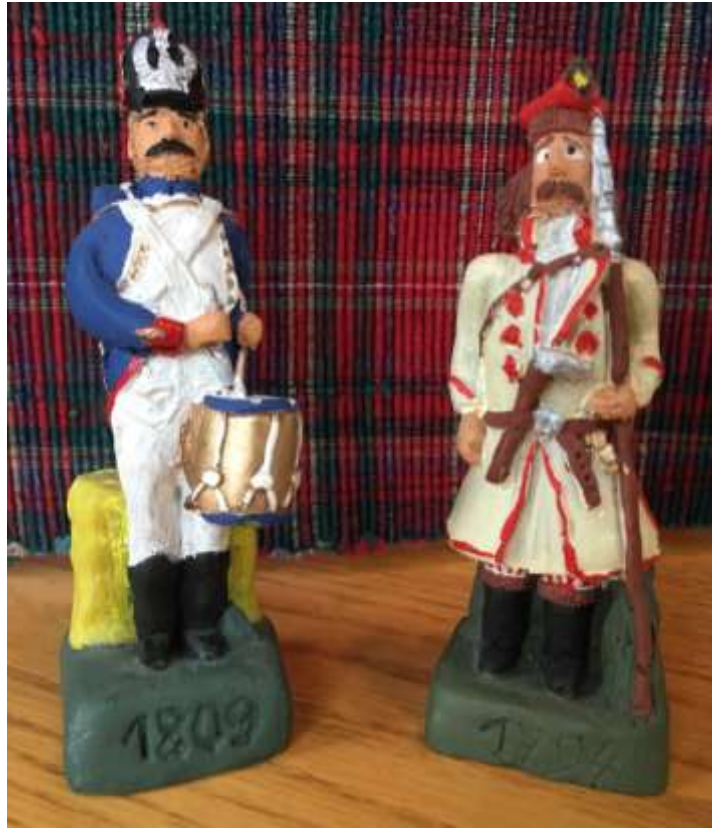
Fig. 5 Polish soldier of Napoleon's Grand Army and a Tadeusz Kosciuszko freedom fighter of 1794