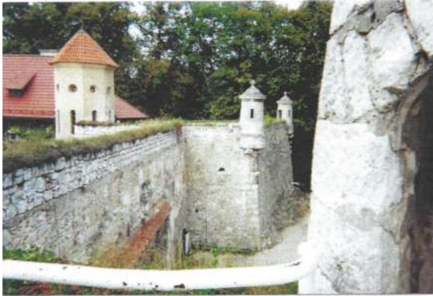
Fig. 4 Limestone castle

We entered Czestochowa, a modern, industrial city, but of course my reason for being there was to see the great icon of Christianity, the Black Madonna. The painting of Mary and Baby Jesus has uncertain origins. It is said by some to go back to Mary and St. Luke himself. Catholic tradition gives the painting on wood great power. Determined enemies were unable to take it from its sanctuary in the Jasna Gora Monastery on several occasions and when finally taken by vandals, the icon's assailant was struck down dead. Today it is protected in the church within the fortified monastery and available for pilgrims and tourists to see during certain hours. Unfortunately, we missed the display of the icon but I was able to get some photos of the buildings and grounds. I will never forget the feeling of power in the place and the devotion of the believers in prayer.