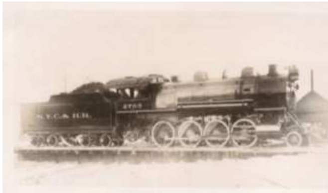
Fig. 3: New York Central-Hudson River Railroad, Steam Locomotive Schenectady Locomotive Works; 1905