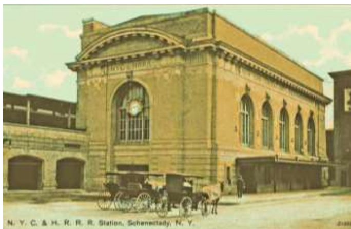
Fig. 4: New York Central-Hudson River Railroad, Schenectady Union Station

http://www.greatamericanstations.com/Stations/SDY