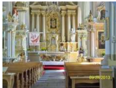
Church of the Blessed Virgin Mary, Ostrorog parish, Poland