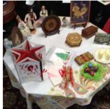
Table of Polish family "treasures."